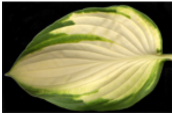
h. 'Royal Golden Jubilee' Registered in 2004