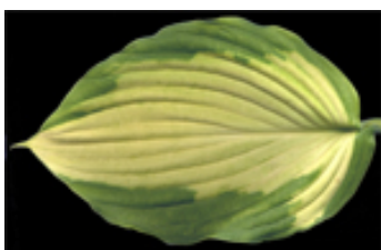
h. 'Captain Kirk' Registered in 1991