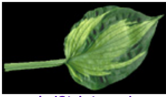
h. 'Striptease' Registered in 1991