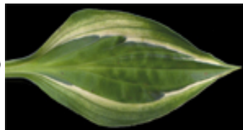
h. 'Hanky Panky' Registered in 2004