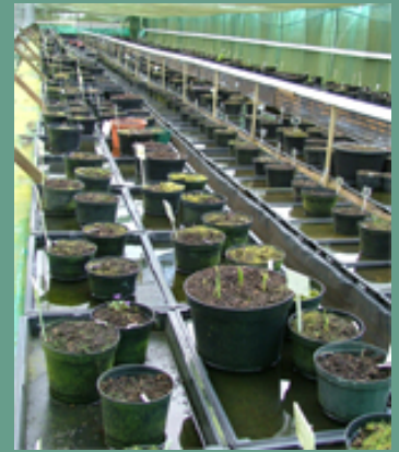
Looking down rows F, G and H