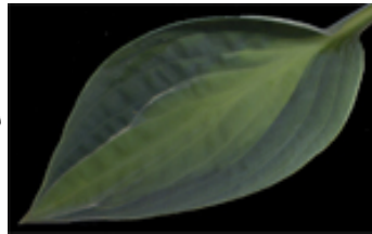
h. 'Kiwi Full Monty' Registered in 2000