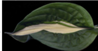
h. 'Risky Business' Registered in 2002