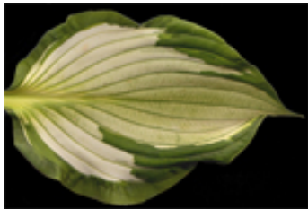
h. 'Brenda's Beauty' Registered in 1992