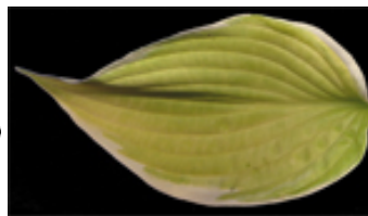
h. 'Zodiac' Registered in 2000