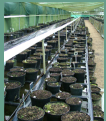
Looking down rows B and C

We thought it looked a bit like racing fencing at this stage without the plants to hide all the structure (click on the images to see more detail):