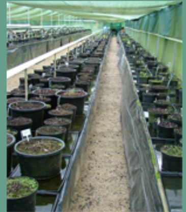
Looking from the entrance to the collection tunnel between rows G and H

We have also been spring cleaning the sales tunnels: