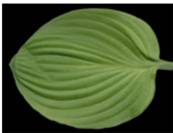
h. 'Richland Gold' Registered in 1987