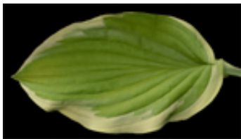
h. 'Paradise Standard'