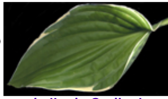
h. 'Lady Godiva' Registered in 2004