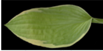
h. 'Moonlight' Registered in 1977