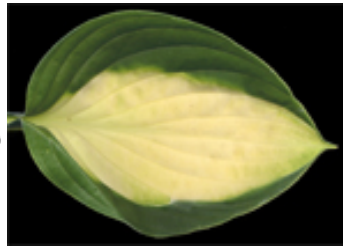
h. 'Gypsy Rose' Registered in 2003