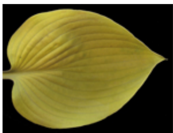
H. 'Bright Glow'