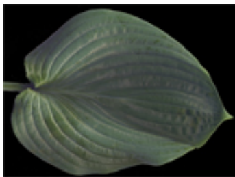
H. 'Blue Hawaii'