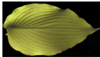
H. 'Choo Choo Train'

H. 'Choo Choo Train' is a large hosta cultivar that has distinctively ruffled leaves that are thick in texture. From a distance it creates a spectacular golden clump that looks quite different from other large golds. It has such presence we couldn't resist plugging it again this year.