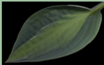
H. 'Kiwi Full Monty'