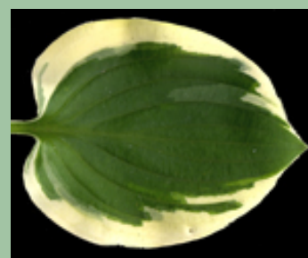
h. 'Lakeside Miss Muffet'