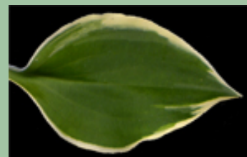
h. 'Lakeside Baby Face'

We expect the miniature varieties to continue to be popular in 2010 and we are pleased to be able to offer four more for sale: