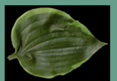
H. 'Beauty Substance' Unregistered sport

Due to the number of cultivars that have been produced from h. 'Sum and Substance' we only have space to include images of our personal favourites: