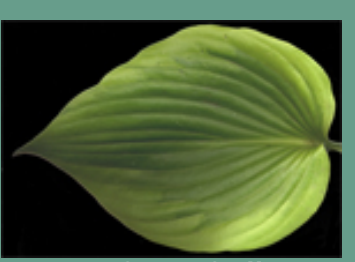
H. 'Sum of All' Registered in 2003