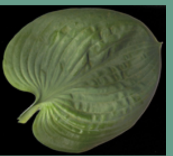
H. 'Metallic Sheen' Registered in 1999