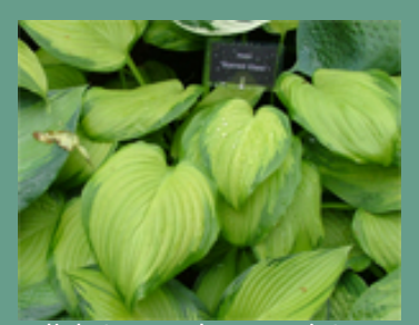
click to see larger picture

We have a full list of all the fragrant varieties in our collection but not all are available for sale so do check out the individual varieties for pricing.