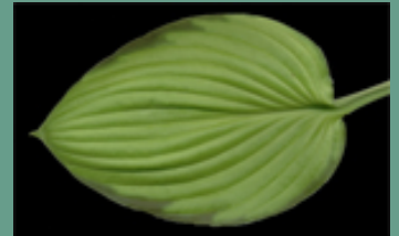
6. h. 'Gold Standard'