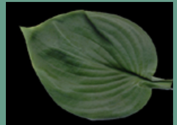
8. h. 'Blue Cadet'