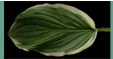
5. h. 'So Sweet'