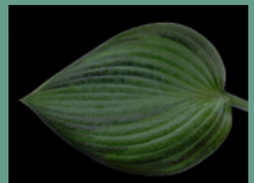
10. h. 'June'

The advice and opinions contained within this monthly newsletter have been formed over more than 30 years of experience with the Hosta genus. We are constantly learning and refining that knowledge and would welcome any suggestions that readers of this newsletter would like to make so please contact us .