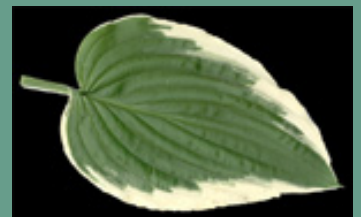
9. h. 'Fortunei Moerheim'