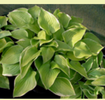
H. 'Olympic Edger'