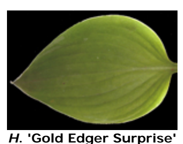
H. 'Gold Edger' sport registered in 2002