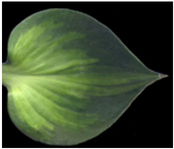
H. 'Dinky Donna'H. 'Radiant Edger' sport registered in 2009