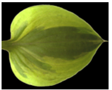
H. 'Radiant Edger'H. 'Gold Edger' sport registered in 1990