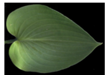
H. 'Pacific Blue Edger'H. 'Gold Edger' sport registered in 2009