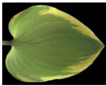
H. 'Cream Edger'Unregistered h. 'Gold Edger'sport. It looks very similar to h. 'Olympic Edger'