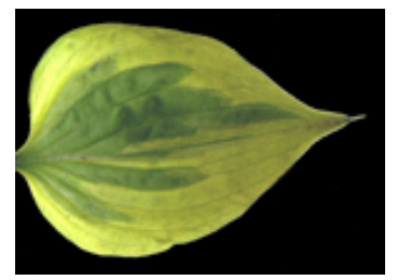
H. 'Hawkeye'H. 'Gold Edger' sport registered in 1999. It looks very similar to h. 'Radiant Edger'