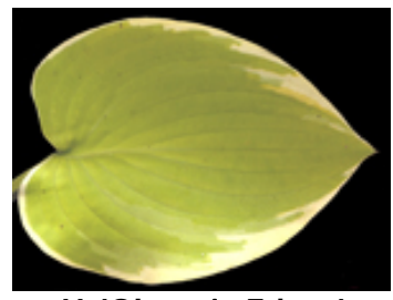
H. 'Olympic Edger'H. 'Gold Edger' sport registered in 1999