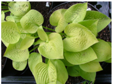
H. 'Little Aurora'