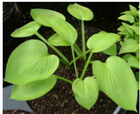
H. 'Golden Prayers'