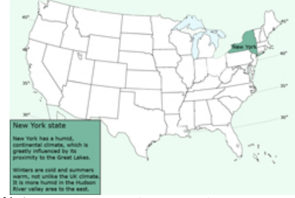
Note: Lake Ontario (not shown) lies along the northern boundary of the state.

Click on the map opposite to find out a few facts about the growing conditions found in New York.